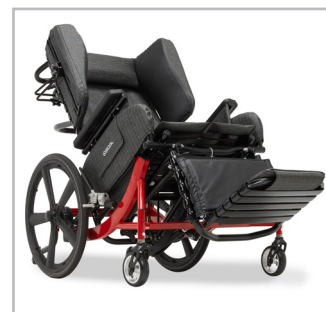
Front pivot seat tilt maintains a forward line of sight, enhancing engagement.