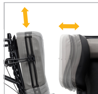
Adjustable upper lateral supports fit a variety of users