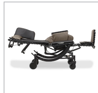
Tilt-in-space functionality provides additional pressure offloading