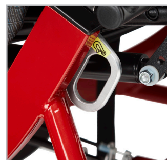
Optional WC-19 Transportation Package enables safe patient travel