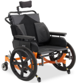
(shown with optional upgrades)